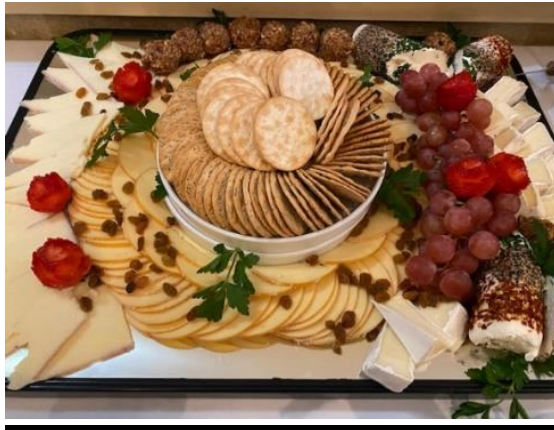
Pictured: From our banquets - Cheese platter